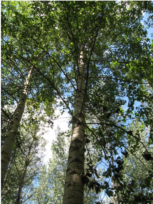
Populus maximowiczii hybrid progeny test, Shipshaw, Saguenay region.