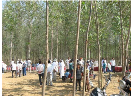
Farmers and field tour participants mingle in 5-year-old P. deltoides .