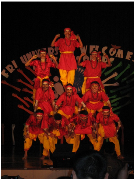
FRI university students present dance program.

IPC 2012 was hosted jointly by the Forest Research Institute (FRI) and the Indian Council for Forestry Research and Education (ICFRE) in late October and early November. Four days of technical sessions took place on the 500 hectare, impressively landscaped campus of FRI, which is effectively a forestry university, in the foothills of the Himalayas in Dehradun, Uttarakhand, with plenary sessions held in the main building, constructed in 1929 and reputed to be ‘bigger than Buckingham Palace.’ Lavish and colourful social and cultural events took place every evening during the week of the session. A two-day pre-Session field tour started in the Indian capital, Delhi, and ended in Dehradun, enabling participants to see poplar growing and processing at first hand and to meet local farmers. Following the Session, a four-day field tour starting in Dehradun and ending in Delhi showed poplars in private agroforestry use, as well as in government block plantings, and featured demonstrations of poplar breeding techniques and trials. In all, 227 people from 23 countries participated in IPC 2012, with about 30 people on each of the field tours.