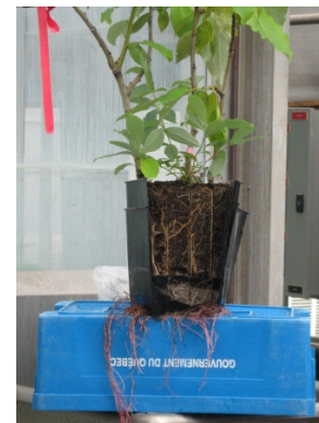
Double-container system for rooting of cuttings.