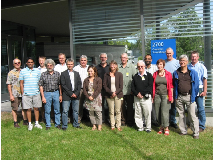
Workshop participants at Ste-Foy, Québec.

The first day of the three-day event took place in the headquarters of the MRNF Forest Research Directorate in Ste-Foy and featured oral and poster presentations on national activities and issues in poplar and willow genetics, including challenges with genetic resource preservation, continuation of poplar research, certification and variety protection. Progress with the development of a national breeding strategy and action plan for native and exotic poplars, aspens and willows