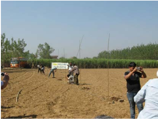
Planting poplar whips in farm field. (Sugar cane in background)