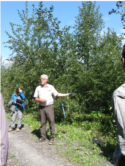
P. suaveolens progeny trial, Ste.-Luce nursery.

The two-day workshop field-tour travelled east of Quebec City to the Bas-St.-Laurent region south of the St. Lawrence, with an overnight stop in Rivière-du-Loup. A scenic ferry crossing of the St. Lawrence on the second morning was followed by a visit to the dramatic Saguenay Fjord and an extended series of field stops at Shipshaw near the town of Chicoutimi north of the St. Lawrence. Field stops in the Bas-St.-Laurent region were all in the MRNF Ste.-Luce nursery, which is oriented primarily to production of conifer seedlings in containers in plastic-covered ‘tunnels’, but also features a number of field trials involving poplars. These include a progeny test of Populus suaveolens , a close relative of balsam poplar native to north-central China, Mongolia and eastern Siberia, established in 2008, as well as clonal tests of different hybrid poplars established in 2005 and in 2012. The nursery also hosts a demonstration planting of many of the poplar clones which have been developed and are commonly planted in Quebec as products of the long-standing successful poplar breeding program of the MRNF.