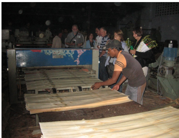
Poplar veneer production, Yamunanagar.