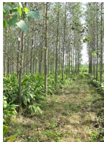
Turmeric growing under 4-year-old P. deltoides .