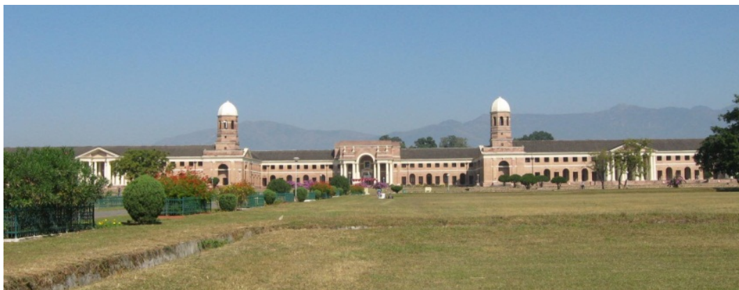
Forest Research Institute, Dehradun, India, site of IPC 2012.