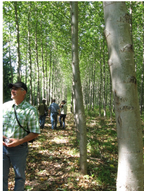
Demonstration planting of common poplar clones, Ste.-Luce nursery.

The Quebec program has also been investigating for many years the potential of another east Asian poplar species, Populus maximowiczii , for planting in Quebec. Commonly known as Japanese poplar, P. maximowiczii is native to northeastern China, eastern Russia and Korea as well as the northern islands of Japan. At Shipshaw, in the good growing conditions of the Saguenay River valley, the field tour visited impressive test plantings of P. maximowiczii established 15 to 20 years previously. The trials included a clonal test of hybrids with P. maximowiczii parentage, a progeny test of P. maximowiczii hybrid selections, and a very fine progeny collection of P. maximowiczii . Also visited in the same area was a 20-year-old progeny test of Populus deltoides selections.